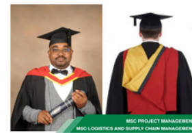
MSc PROJECT MANAGEMENT MSc LOGISTICS AND SUPPLY CHAIN MANAGEMENT