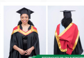
POSTGRADUATE DIPLOMA IN MONITORING AND EVALUATION