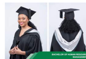
BACHELOR OF HUMAN RESOURCE MANAGEMENT