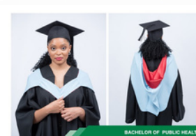
BACHELOR OF PUBLIC HEALTH