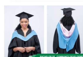
BACHELOR OF COMMUNITY DEVELOPMENT