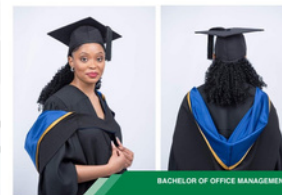
BACHELOR OF OFFICE MANAGEMENT