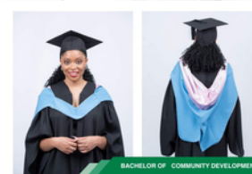
BACHELOR OF COMMUNITY DEVELOPMENT