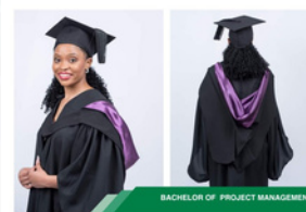
BACHELOR OF PROJECT MANAGEMENT