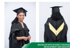
BACHELOR ARTS IN EARLY CHILDHOOD DEVELOPMENT AND EDUCATION