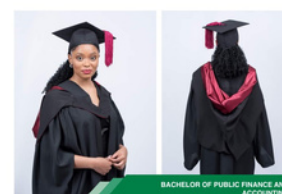
BACHELOR OF PUBLIC FINANCE AND ACCOUNTING