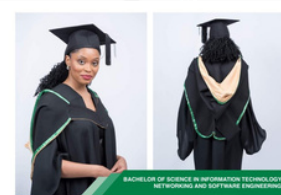
BACHELOR OF SCIENCE IN INFORMATION TECHNOLOGY NETWORKING AND SOFTWARE ENGINEERING