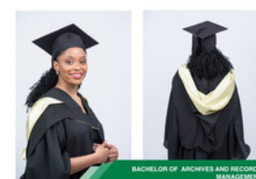
BACHELOR OF ARCHIVES AND RECORDS MANAGEMENT