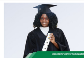
IDM CERTIFICATE PROGRAMMES

Plot 6413, Unit 5, Noko Road, Broadhurst Industrial, Gaborone, Botswana telephone: 397 1168 email: info@angels.co.bw