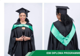
IDM DIPLOMA PROGRAMMES