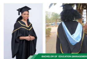
BACHELOR OF EDUCATION (MANAGEMENT)