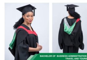
BACHELOR OF BUSINESS ADMINISTRATION IN TRAVEL AND TOURISM