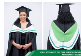
CIPS ADVANCED DIPLOMA IN PROCUREMENT AND SUPPLY - LEVEL 5