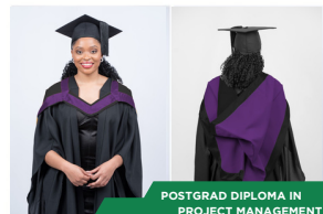
POSTGRAD DIPLOMA IN PROJECT MANAGEMENT