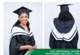
CIPS PROFESSIONAL DIPLOMA IN PROCUREMENT AND SUPPLY - LEVEL 5